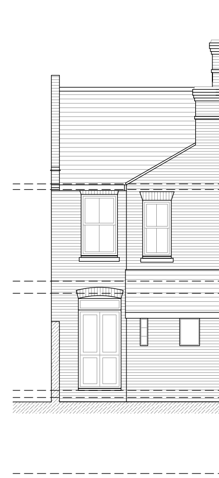
Rear (South-East Facing) Elevation 1:100