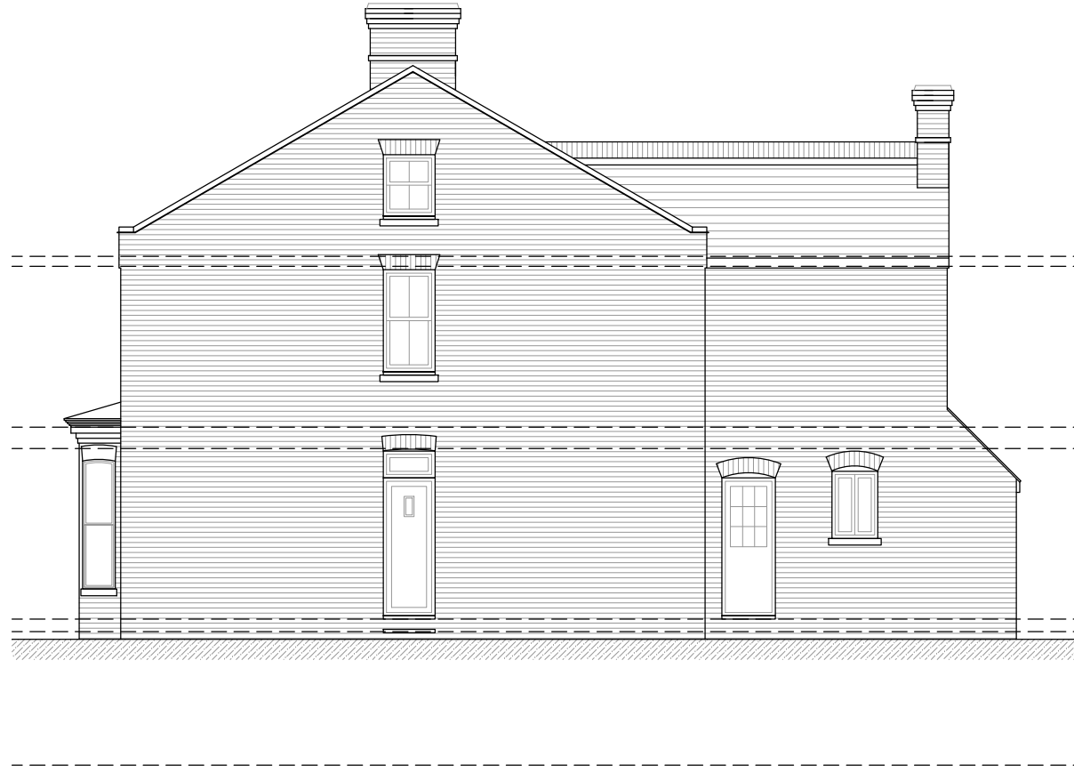
Side (South-West Facing) Elevation 1:100